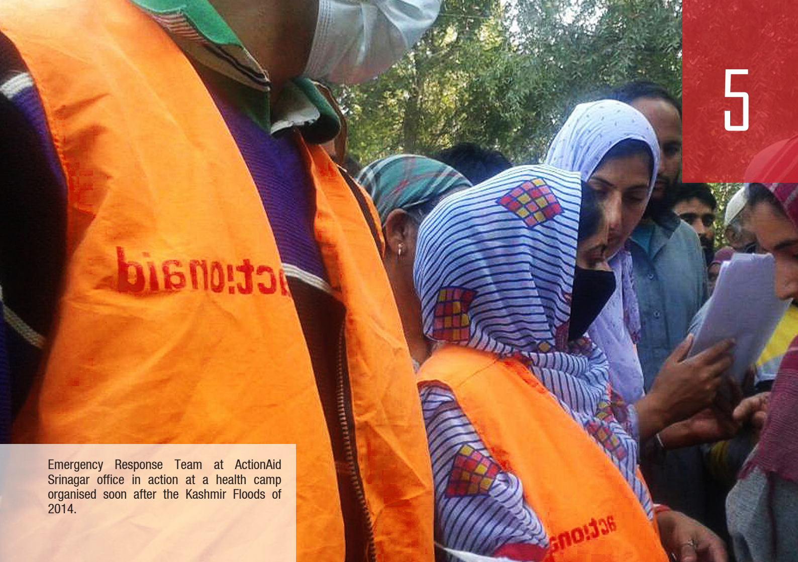
Emergency Response Team at ActionAid Srinagar office in action at a health camp organised soon after the Kashmir Floods of 2014.