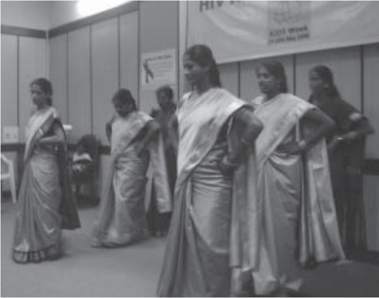
MILANA peer counsellors shedding inhibitions and dancing at the positive people's meet during the Global Week of Action

Women in MILANA were at the forefront of the protest against the drug, Emtri, which caused severe side effects. The drug was introduced to the free Government ARV Roll out programme, replacing the medicine manufactured by Cipla. With the change in companies, many PLHA experienced severe side effects. They brought this to the notice of the National AIDS Control Programme, the Karnataka State AIDS Control Society as well as AIDS-e-Forum on HIV&AIDS, causing other groups of PLHA from across India to respond with their experiences of side effects. Senior officials from Emcure, the pharmaceutical company manufacturing the medicine came to MILANA to defend the quality of their products. The women at MILANA stood by their concerns and demanded