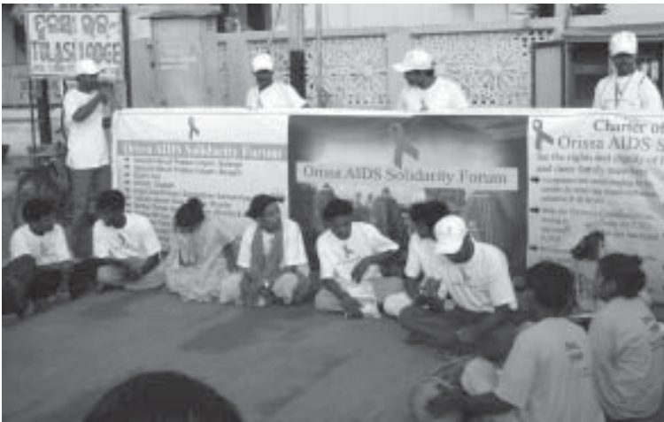
Members of Orissa AIDS Solidarity Forum presenting the Charter of Demands

Orissa AIDS Solidarity Forum, Orissa: The Orissa AIDS Solidarity Forum (OASF) with a membership of 15 organisations across 18 districts of Orissa is an inclusive state-level consortium of individuals, NGOs, CBOs, networks of PLHA and AIDS activists. The Forum believes in having a collective voice and collective actions, binding all the partner organisations and giving a uniform identity.