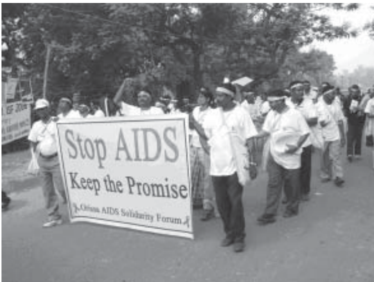
AIDS Activists Demand Accountability during the Positive Rally

Positive living and demands for a life of dignity echoed through the Positive People’s Assembly. Over 20 PLHA spoke on the themes of women living with HIV, vulnerable communities, access to services in different states in India, children and HIV, etc. Interspersed with the positive speakers were role plays, songs, dances and music, all giving messages of hope.