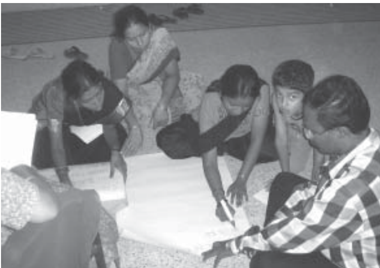
Fellows sharing and learning at the training workshop

The fellowship programme with 24 PLHA was initiated in December 2005. The programme is inimitable and aims to develop the capacities of PLHA to uphold their rights by self development, shared learning and community mobilisation. The Fellows comprise fifteen women, one sexuality minority and eight men.