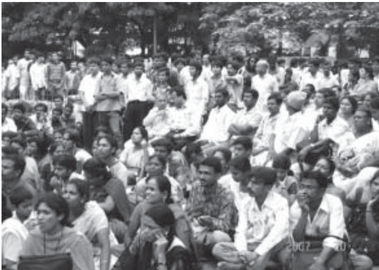
The strength in togetherness

In 2006, ActionAid and its partner organisations working on HIV&AIDS allied with several networks and organisations across India. Prevention, access to treatment for PLHA, fighting stigma and discrimination, protection of rights of PLHA are some of the core themes taken up by Alliances.