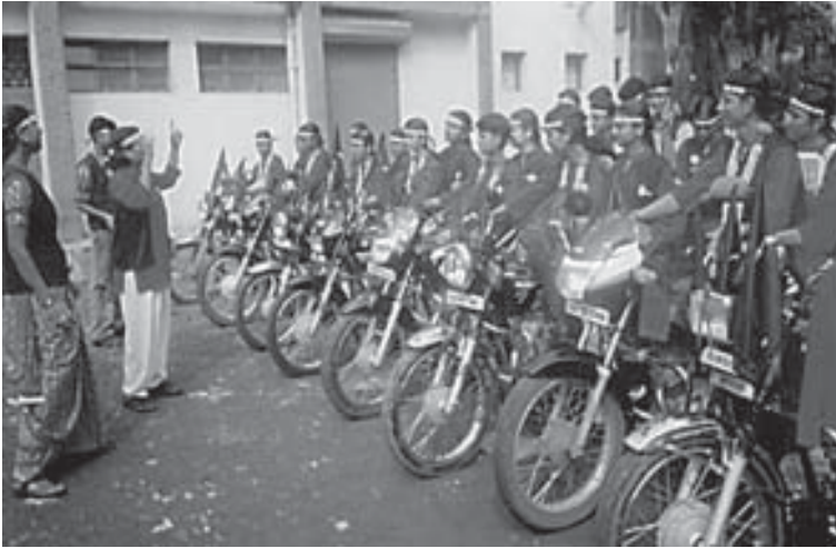
Women Bikers at the outset of the Rally