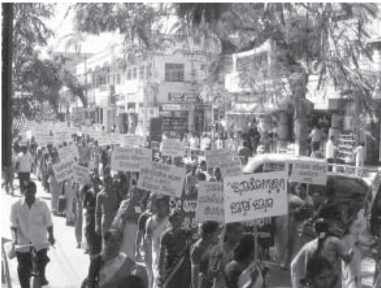
Positive people at a protest march