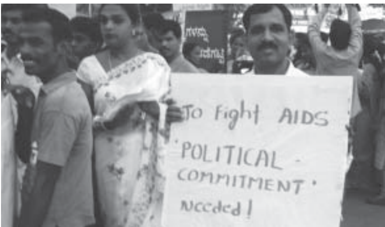
AIDS Activists demand political commitment at a Rally