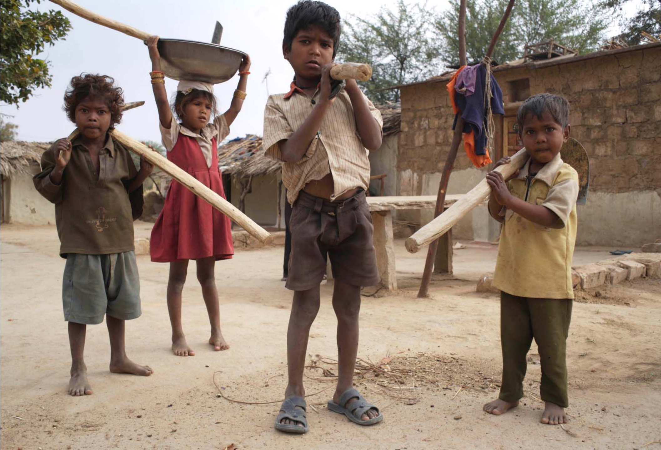
Children carry tools for their parents employed in digging a well in Sahariya community village in Madhya Pradesh as part of the National Rural Employment Guarantee Act (NREGA). It provides at least 100 days of employment for every rural household.