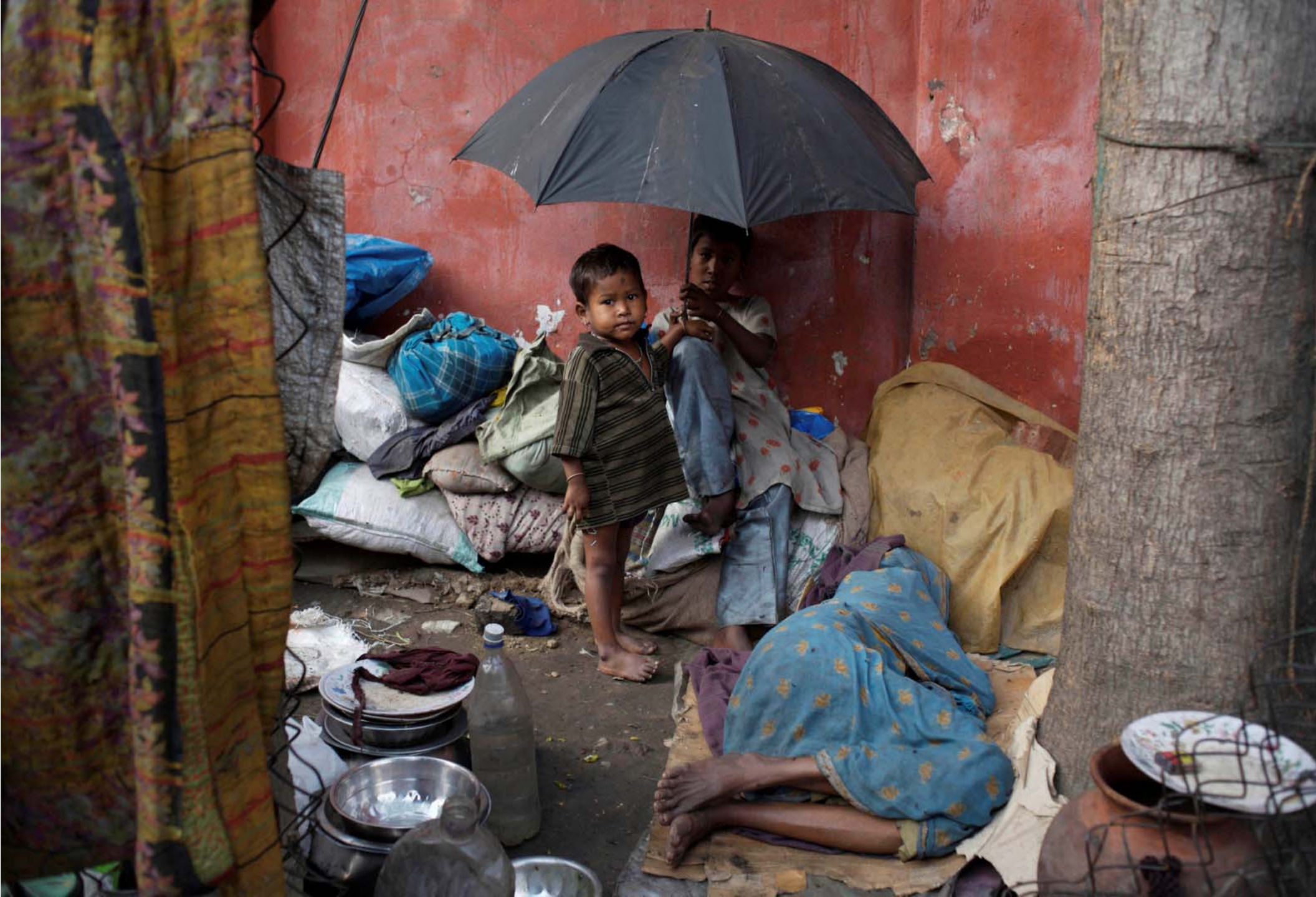
Children pass the time while an adult sleeps on the pavement in Kolkata, West Bengal. Children are undernourished and suffer the regular bouts of illness associated with living in unsanitary conditions.