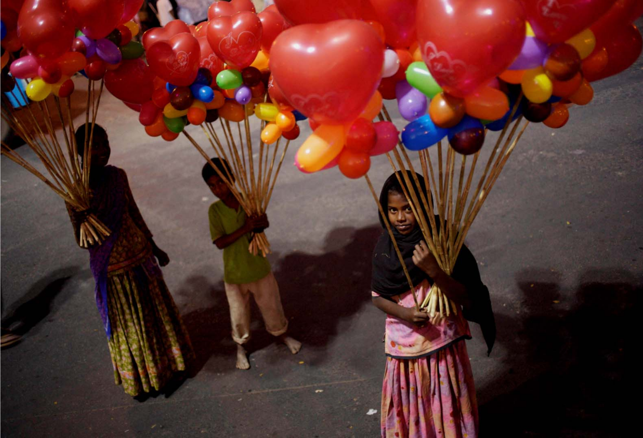
At evening rush-hour, children earn a living by selling balloons to commuters outside central Bangalore's main bus terminal. This is a common sight in most of India's urban centers in an ironic contrast to the hyper economic growth.