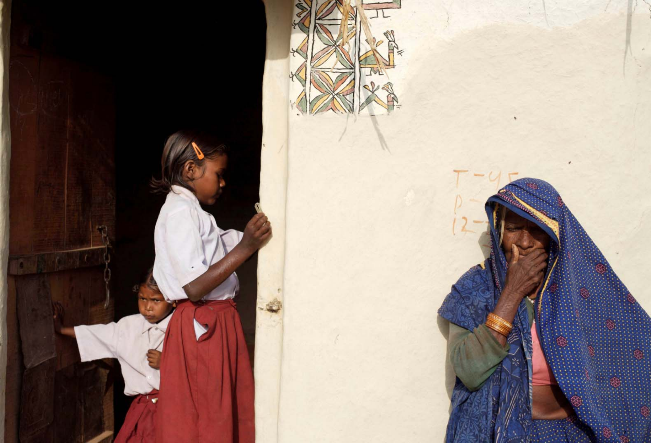
Two girls dressed for school at home in Shankargarh village, Madhya Pradesh. The local school, established in 2003, as a part of the Sarv Shiksha Abhiyan. They are the first generation in the family to attend school.