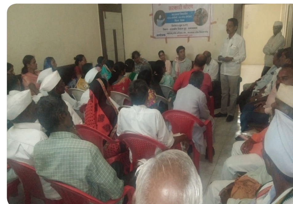
Osmanabad, June 7, 2019

With Maharashtra reeling under drought, our teams are visiting the drought-hit regions of Vidarbha and Marathwada to take stock of drought and discuss water crises with local networks, activists, legislators, farmers, farmers' widows, local officials etc.