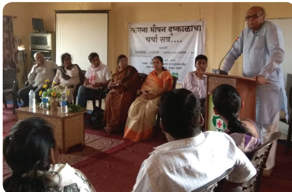
Amravati, June 4, 2019