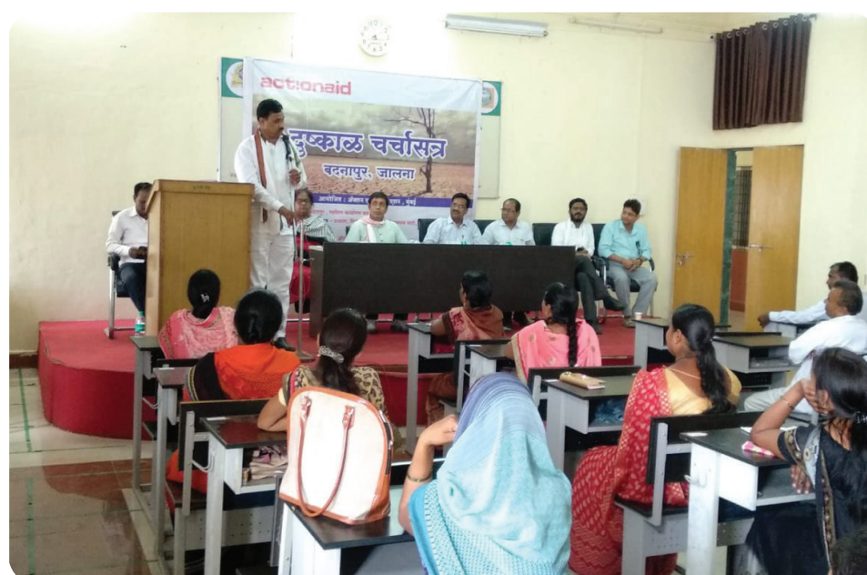
Jalna, June 6, 2019