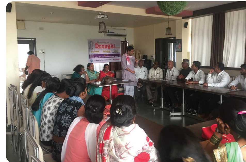
Solapur, June 8, 2019

With Maharashtra reeling under drought, our teams are visiting the drought-hit regions of Vidarbha and Marathwada to take stock of drought and discuss water crises with local networks, activists, legislators, farmers, farmers' widows, local officials etc.