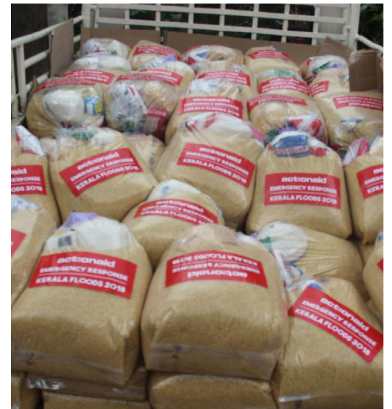
Relief packages containing dry rations for affected families being transported for distribution.

In Wayanad, Idukki, Alappuzha and Pathanamthitta districts, dry rations consisting of rice, pulses, sugar, cooking oil salt and tea powder were distributed to 1,032 families from poor and vulnerable communities affected by the floods. In addition, 30 kg of food items were distributed to families in Pathnamthitta district for the celebration of Onam festival which benefitted a population of 2,000. In Alappuzha, Kitchen utensils were distributed to 21 families.