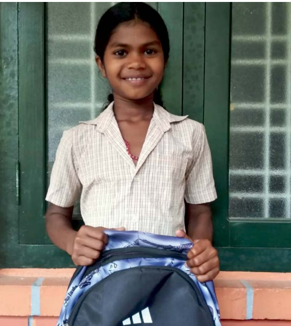
A delighted girl on receiving the education kit.

In Wayanad, 45 children were given education kits consisting of school bags, notebooks, pen, pencil, instrument box, water bottle, umbrella etc. We also facilitated education scholarship to 10 girls studying in different classes. Each girl received a cheque of ₹10,000. They belong to poor families whose houses have been severely damaged in the floods. As their parents are wage workers, they were not able to support their children's education in a time of crisis.