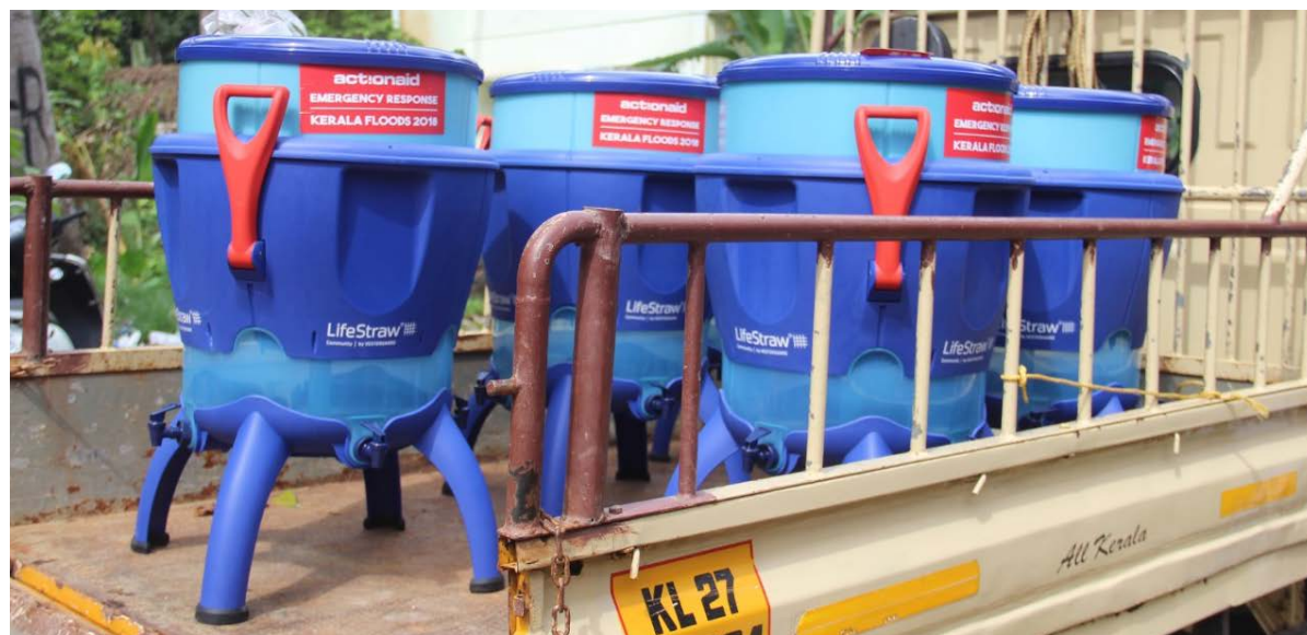
Water purifiers en route to Alappuzha for distribution; the floods had damaged water sources which were used for drinking and domestic purposes by the locals.