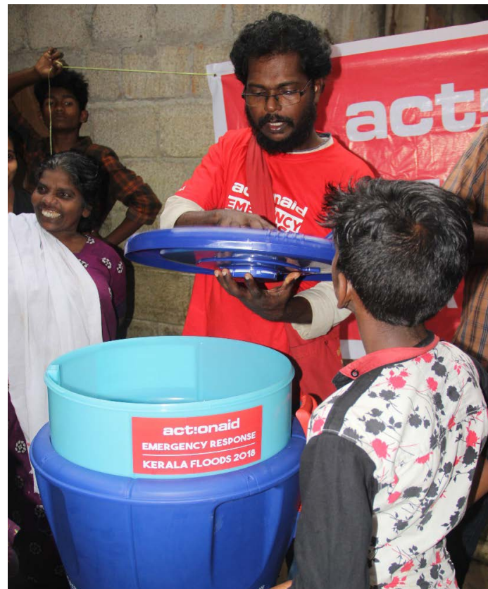
Emergency response team demonstrating how to use the water purifiers.

Furthermore, we distributed 10 water purifiers in Alappuzha which can hold up to 25 litres and provide clean drinking water to 54 families daily. We also installed 4 water tanks in a primary school which have benefitted 150 children and 60 families. The water tanks have been handed over to the panchayat which has now taken responsibility of filling them on a regular basis. Another water tank was installed in a different location in Alappuzha where benefitted 15 families.