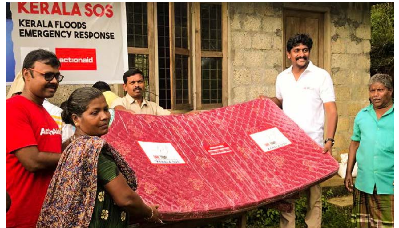
A mattress being handed over to a flood-affected family.

As shelter support, we provided mattresses and cots to 800 families in Idukki, Alappuzha and Wayanad. In Alappuzha, we also repaired 32 houses belonging to most vulnerable groups including single women and families who are from socially and economically marginalised communities. In addition, cash support of ₹20,000 was given to families whose houses were severely damaged during the floods.