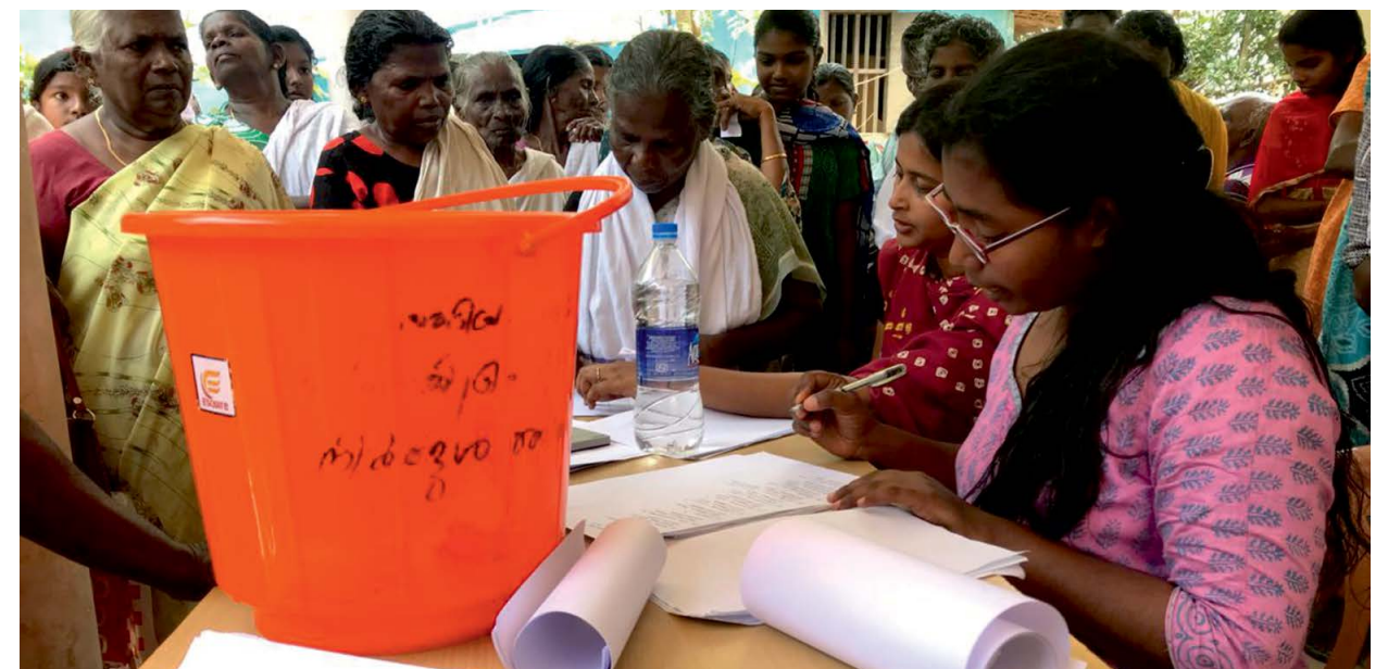
Empowering women leaders to lead the relief distribution and rehabilitation process.