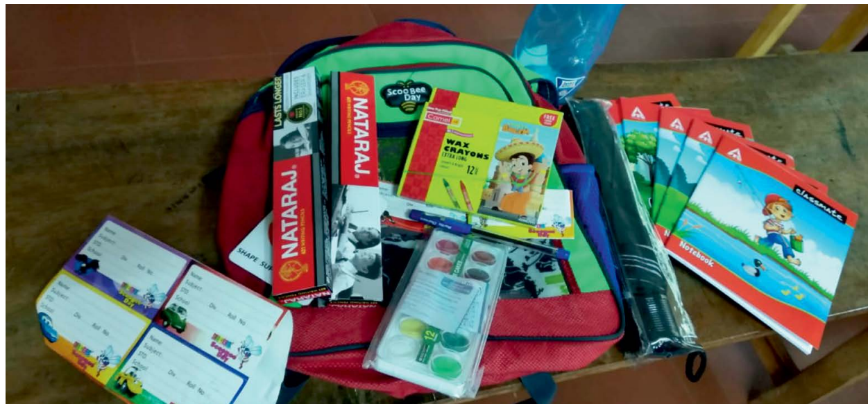
One of ActionAid's priorities when responding to emergencies is making sure children's education does not get affected.