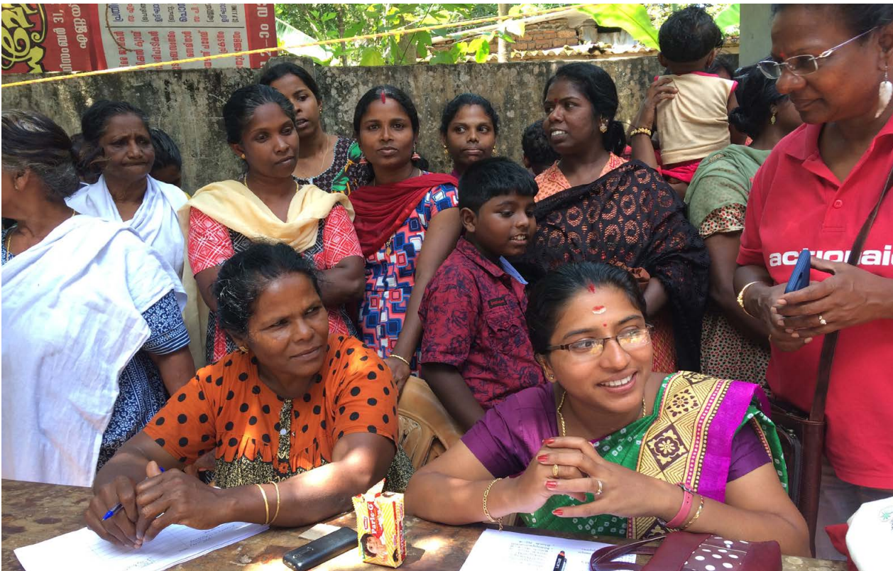
Women collectives play an important part in providing livelihood support to affected families and ensuring faster recovery from natural disasters.